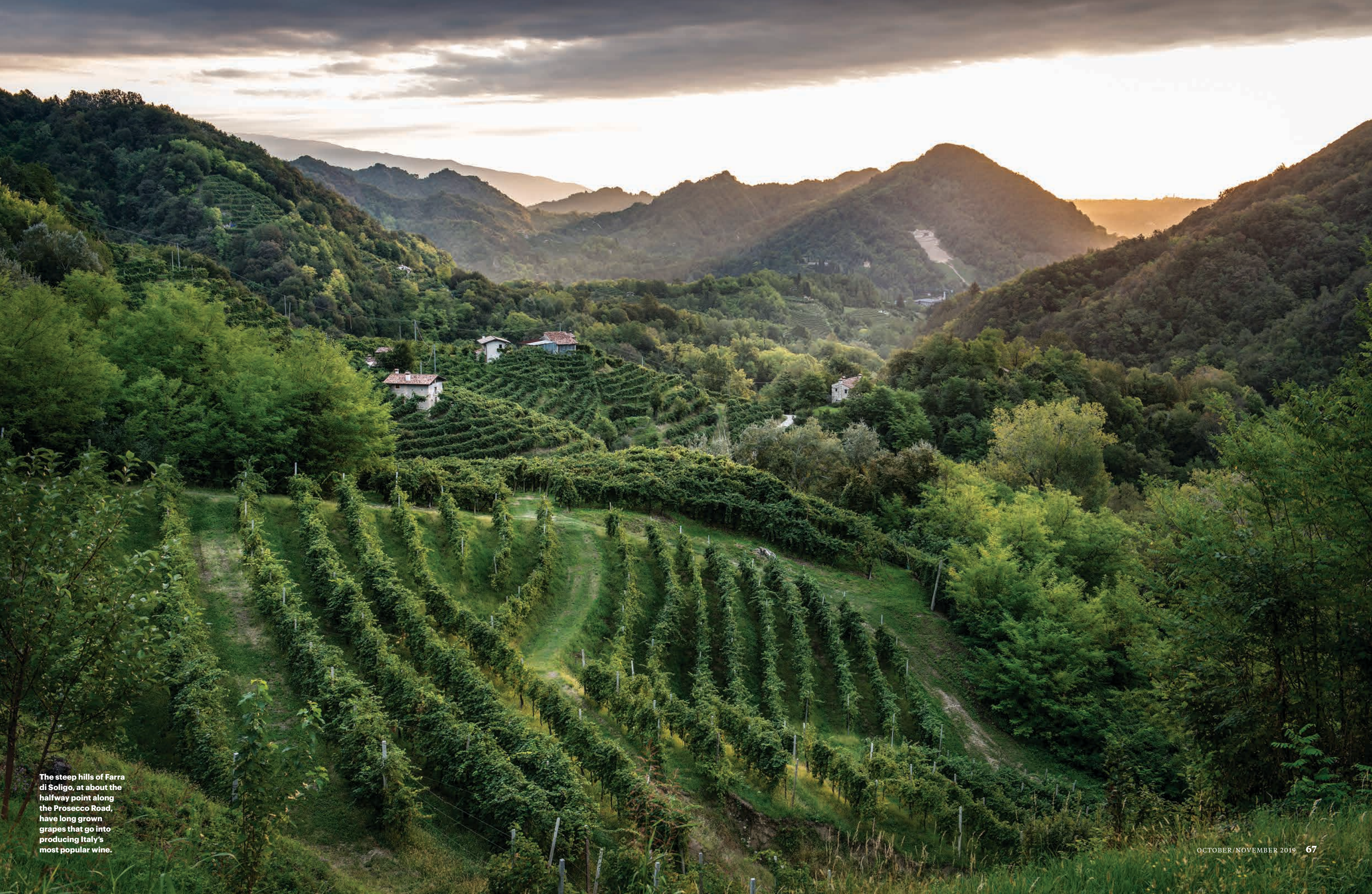
The steep hills of Farra di Soligo, at about the halfway point along the Prosecco Road, have long grown grapes that go into producing Italy's most popular wine.