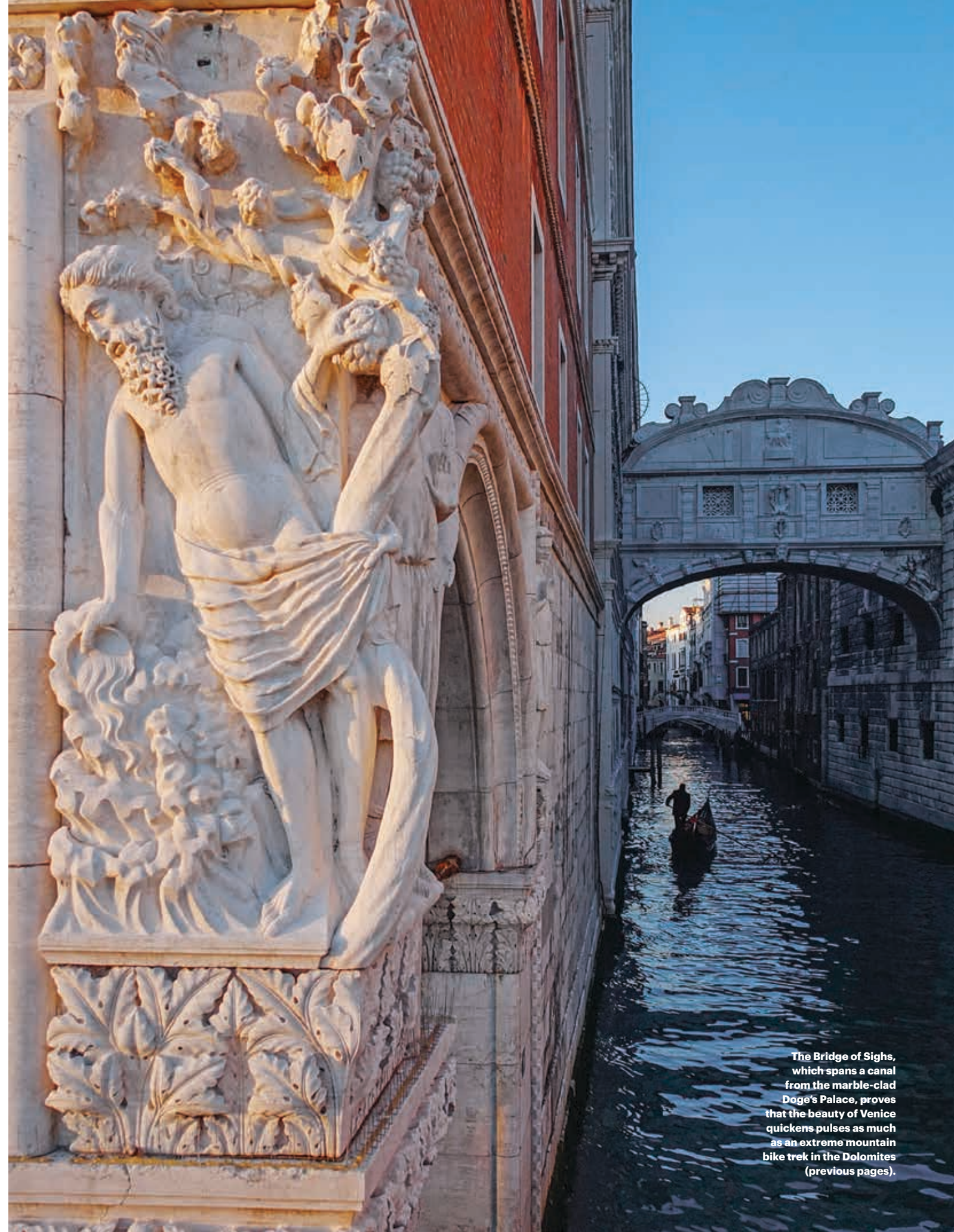
The Bridge of Sighs, which spans a canal from the marble-clad Doge's Palace, proves that the beauty of Venice quickens pulses as much as an extreme mountain bike trek in the Dolomites (previous pages).