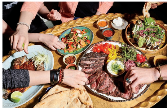
▲ A Rake’s Progress, a restaurant within the Line DC that showcases mid-Atlantic ingredients.