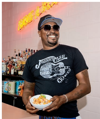
◀ From far left: The Contemplation Court at the National Museum of African American History & Culture; a staffer at Tiki TNT, a tropical-themed bar at the Wharf.