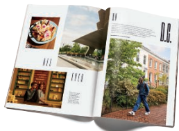
(Washington, D.C., continued from page 167)