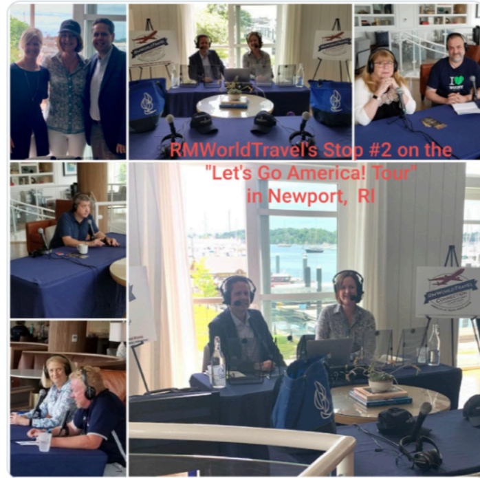
1:36 PM · Jun 12, 2021 · Twitter Web App

#1 Travel Radio Show @RMWorldTravel And on Day 5 of Stop #2 on RMWorldTravel's "Let's Go America! Tour" we broadcasted live from the new Brenton Hotel in Newport, RI. If you missed this jam-packed edition of America's #1 Travel Radio Show, it's been archived for you to enjoy anytime here - rmworldtravel.com/podcasts/2021-2