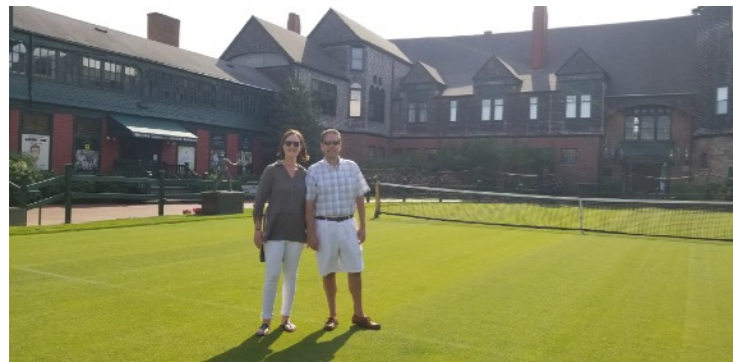
International Tennis Hall of Fame